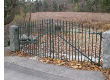
The Gate at Pageant Field