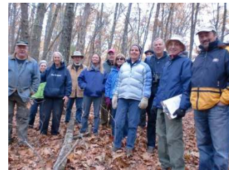
Burns Hill walkers Nov. 2014