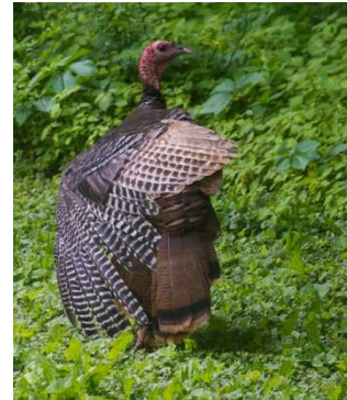
Wild Turkey

Winter is a good time to take stock of the wildlife reports I have received in the previous year. Each month, contributors send me reports of flora and fauna they have observed in Westford that month. I publish these reports in a monthly column called "Westford Wildlife Watch", which appears in the Westford Eagle. This column has been appearing in the paper since 1990, so we have compiled quite a lot of information about Westford's wildlife during that time. Westford friends, Mau and Maurilio Fernandes, take the data and produce charts to display the trends.