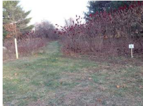
Peace Trail, Trailhead

There is currently an active group of Land and Trails volunteers who visit conservation land areas to monitor and take care of these wonderful places. They pick up litter, although usually litter on roads is much more common than litter on trails. The volunteers also monitor the land areas and report to the Conservation Commission or the Conservation Trust if they see anything that should be corrected. In one example, they recently reported that a black plastic silt fence has been left in-place for many years after Rome Drive was constructed.