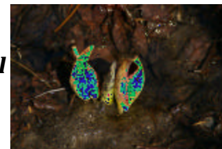
Skunk Cabbage along the Acker Tail