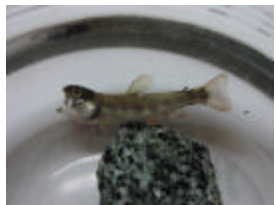
Reed Brook, part of the Living Lab at the Day School is a cold-water stream that supports native Brook Trout. These are now rare in Eastern Mass. According to Mass Wildlife, brook trout occupy less than half of their original range in Massachusetts