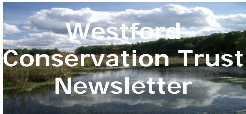
Beaver Brook near Forge Pond