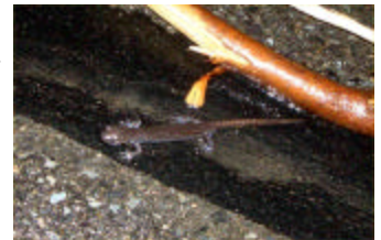
Blue Spotted Salamander in Westford, April 2006

Vernal pools are important and sensitive components of our environment. To remain healthy, these pools require that land upland to the pools be preserved as habitat for creatures that migrate out of the pools when they dry up. Some Mole Salamanders, especially our state-listed Blue Spotted Salamander, inhabit the forest for more than ¼ mile from the vernal pools. While a 200 foot buffer does not seem like much additional protection, this amendment would double the amount of land to be protected, and make for more environmentally-friendly development. While it takes a lot of work to find and certify vernal pools, the Natural Heritage program has, using aerial photography and remote sensing technology, mapped all the water bodies in the state that might be vernal pools.. The methods they use turn out to be about 90% accurate. This inventory of “potential” vernal pools has turned out to be an extremely valuable tool in managing these resources. ConsComm is proposing that Westford, like Sturbridge and several other towns in the Commonwealth, make the assumption that all such potential vernal pools be considered actual vernal pools unless proven otherwise.